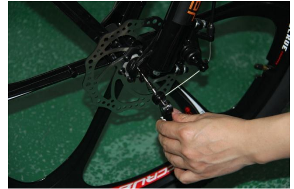
e. Lock the front wheel with quick release