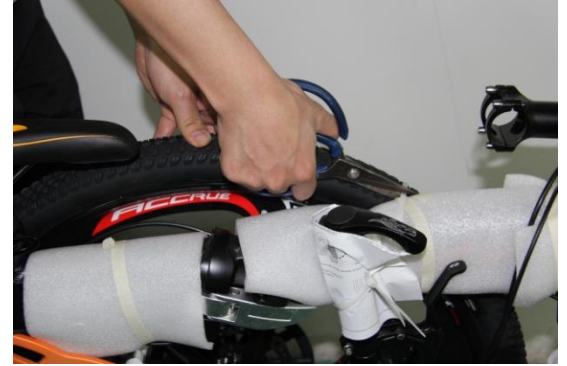
③ Remove the packing