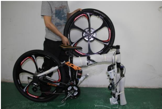
a. Take off the front wheel