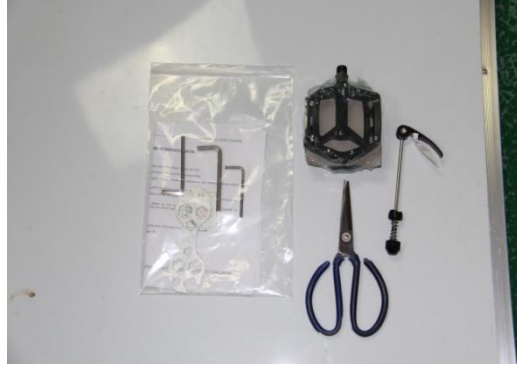
②. Pre-assembling tools