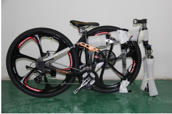
①. Open the box