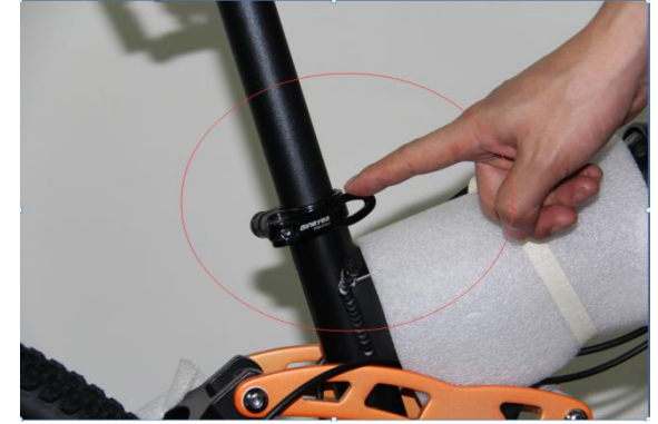
b. Fasten the clamp