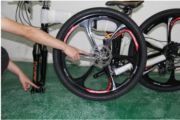
d. Aim the brake disc to the brake device