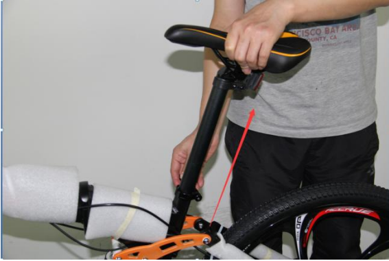
a. Adjust the height