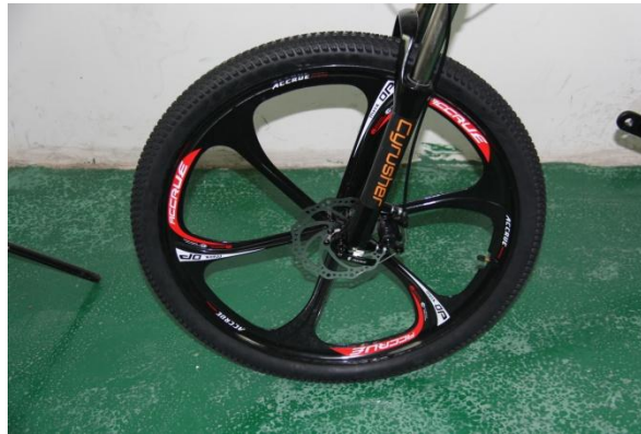
f. The front wheel install completes