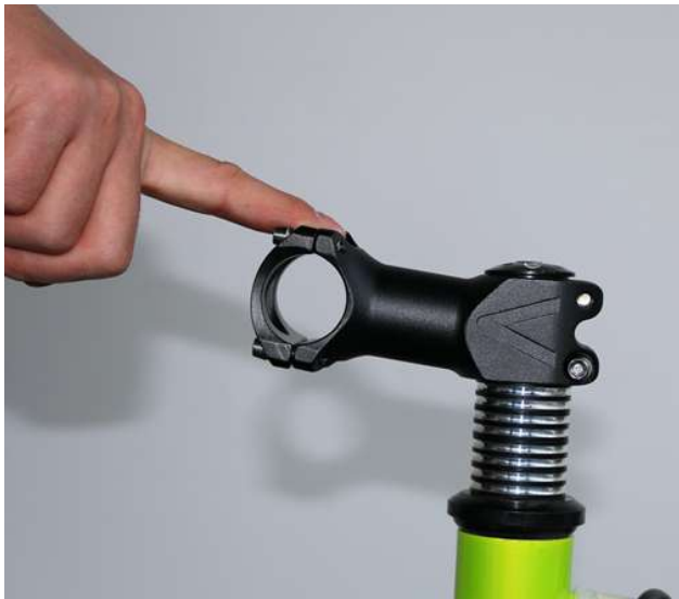
6 turn the stem with 180 degree