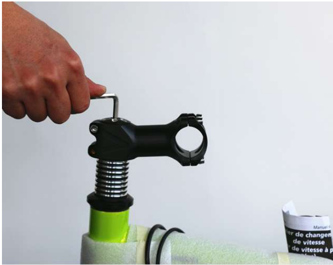
4 take off screws on top of stem