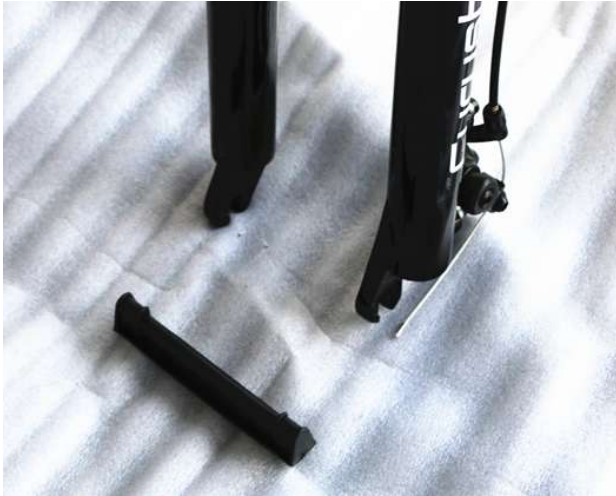
11 remove the plastic protector on disc brake of front wheel