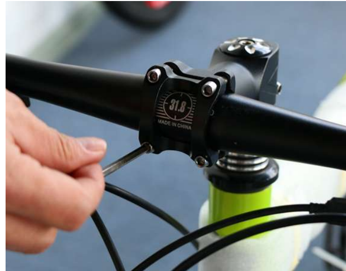
9 put the handle bar on the stem And screw on the cap