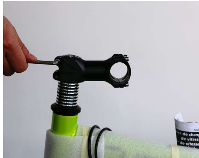
5 take off screws on side of stem