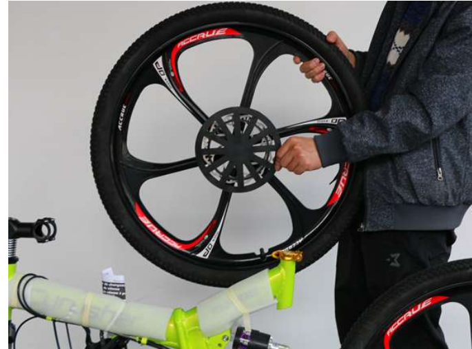
12 remove the protector on end of front fork