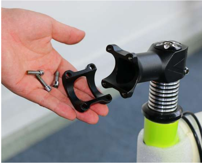
8 take off the stem cap