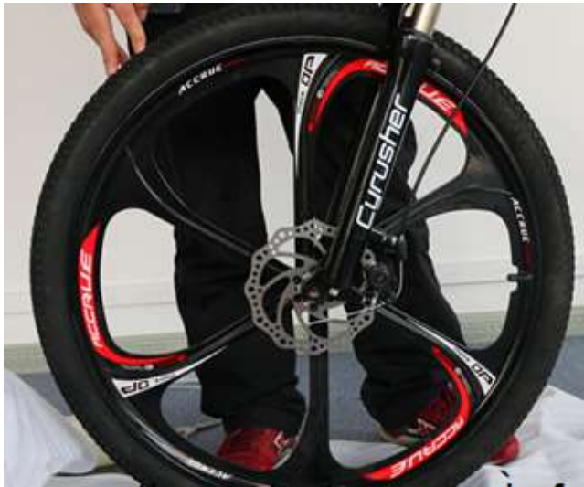
13 put the front wheel under front fork, make sure wheel center aligns with fork holes