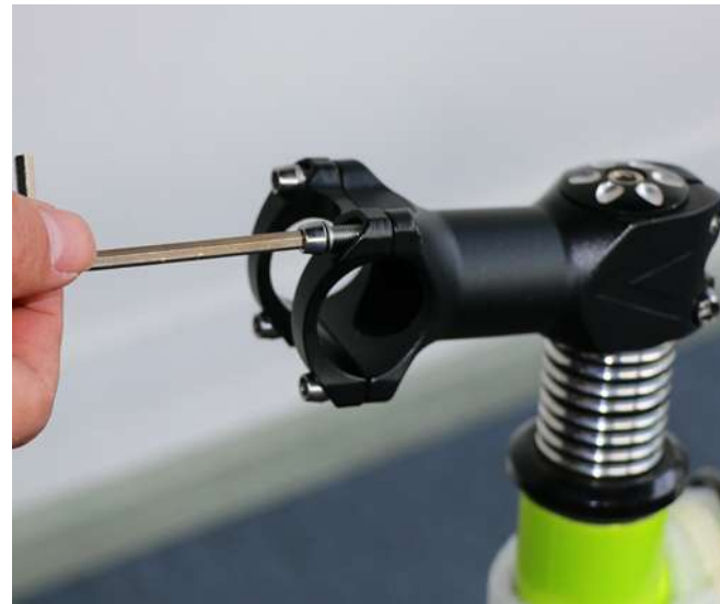
7 screw off the cap of stem