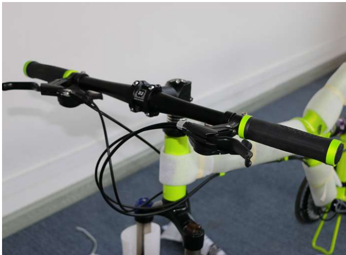
10 finish the handle bar assemble